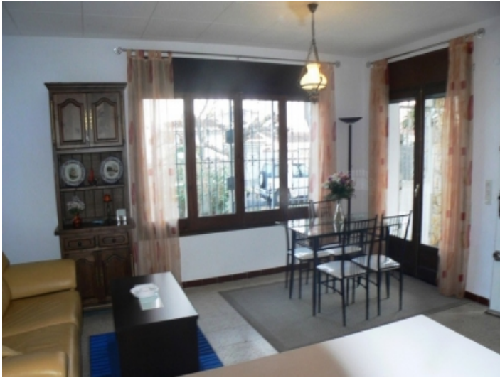
View into livingroom from the open kitchen