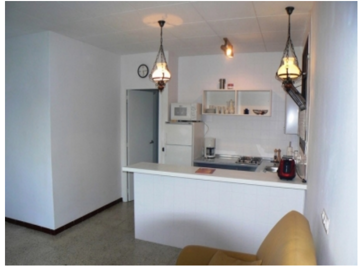
View into the open kitchen